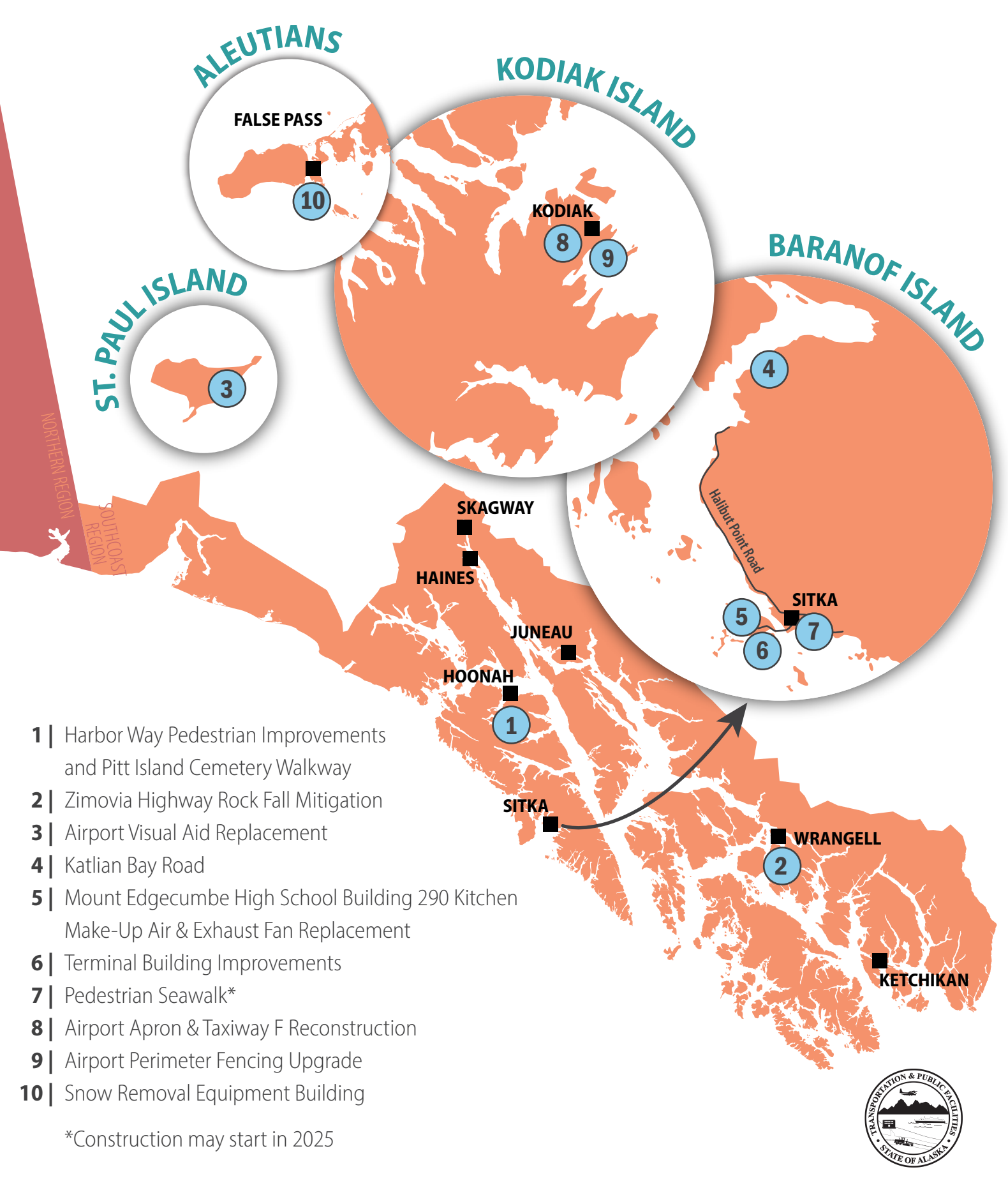
Last updated 4/5/24. See additional map for more Southcoast Region projects.